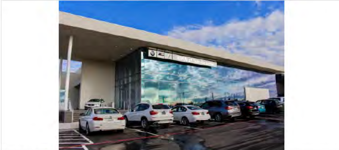
Principle BMW of San Antonio